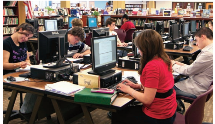
Central High School's new library media center is among the improvements creating a 21st Century learning environment for our students as they prepare for college and career.