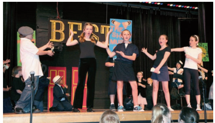
Funded by the ESM Education Foundation, Fremont performed "The Best Little Theater in Town."

on the Roof" was the first musical production in our newly remodeled auditorium.