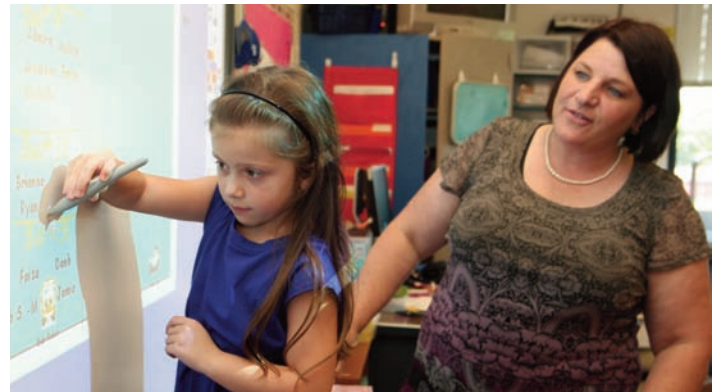
Teachers are engaging students in new ways with interactive whiteboards, which are giant, touch-sensitive computer screens with internet capabilities.

check grades, view attendance, review contact information and more.